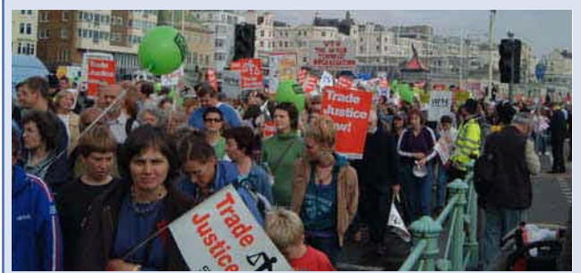
Simpol-UK is a member of the Trade Justice Movement, a network of Non-Governmental Organisations (NGOs) campaigning to change trade rules. Adopters took part in a rally of 6,000 people in September, also taking the opportunity handing out leaflets to promote SP to a sympathetic audience.

To this end, a Learning Forum has been launched on the Yahoo-group list 'simpol', available to all Adopters. Its purpose is to share and cross-fertilise campaigning